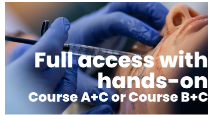
Full access with hands-on Course A+C or Course B+C